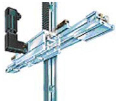
Figure 1: Extruded Aluminum Acuator

The support structure refers to the main base that houses and supports the other components and provides structural integrity for the application. The two most common types of support structure are machined base plates and extruded aluminum profiles. The machined base plates can be made of aluminum, steel, or cast iron. Machined base plates are used when flatness and straightness are critical in the application or when higher rigidity is needed. Applications include measurement systems and grinding or machining systems.